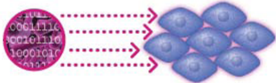
DIGITAL STRESSORS CREATE SIMILAR CELLULAR RESPONSES

ZYTO's bio-communication technology simulates this experience. It uses computer generated digital stressors to stimulate your body, and then listens to and translates your body's response.